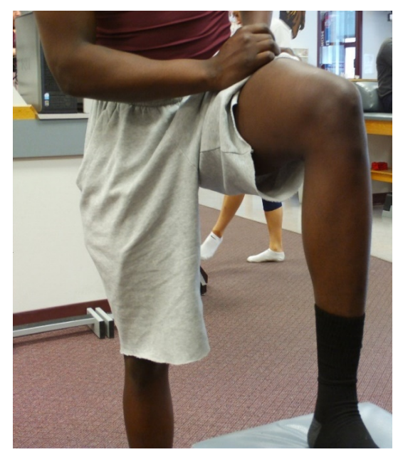
Figure 1: Starting Position for TIR MWM

The patient returned after the weekend (two days after the initial intervention) for a follow-up visit to assess the changes to the MWM and the PILL