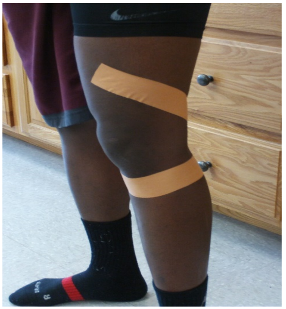
Figure 4 : Tape Application Following TIR MWM. Small wrinkles of the tape may arise as the skin shifts under the adhered tape.

Right hand is encompassing the head of the fibula while the left hand contacts the medial