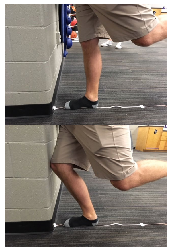
Figure 1. Weight Bearing Lunge Test (WBLT).

Clinical Practice in Athletic Training Volume 1 – Issue 2 – October 2018