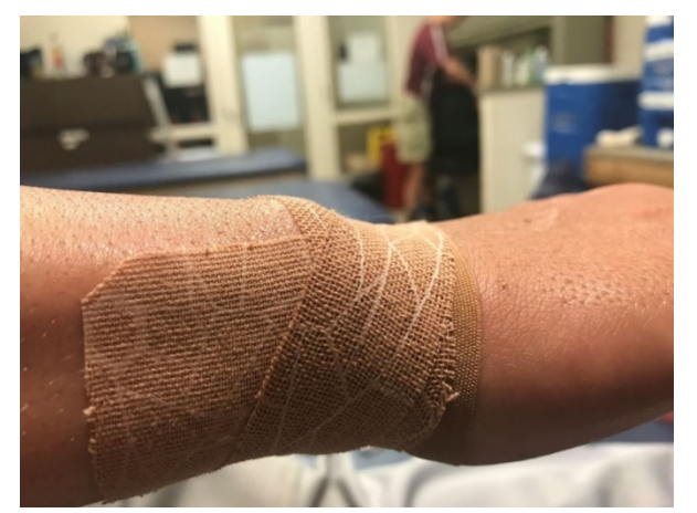
Figure 1: Compression tape for digiti mini strain.

strength, but noted increased pain from the previous day. Additionally, the patient could no longer perform the motion without experiencing significant pain.